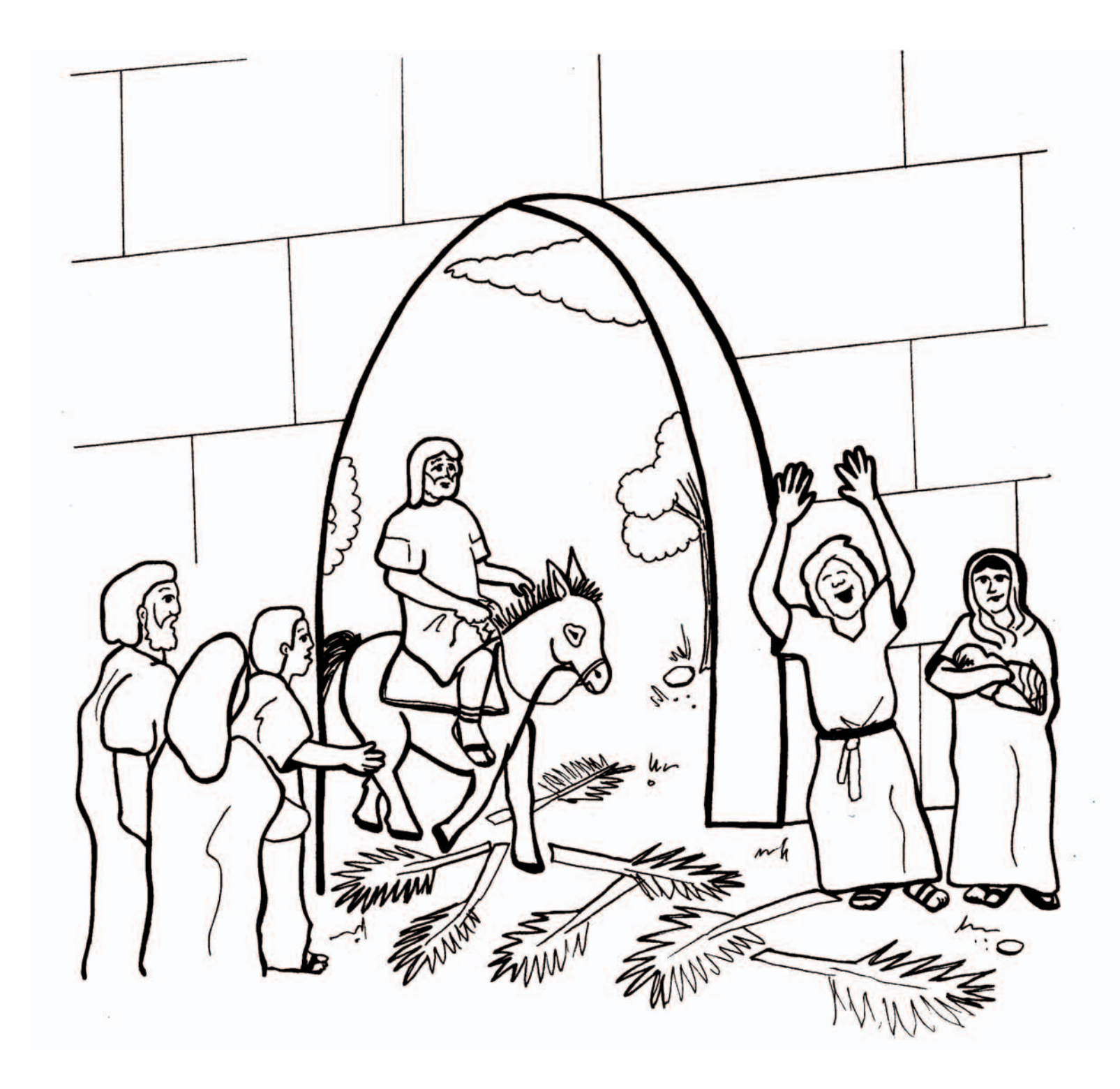
WORSHIP THE LORD! (PSALM 100)

"Enter into His gates with thanksgiving, and into His courts with praise. Be thankful to Him, and bless His name."