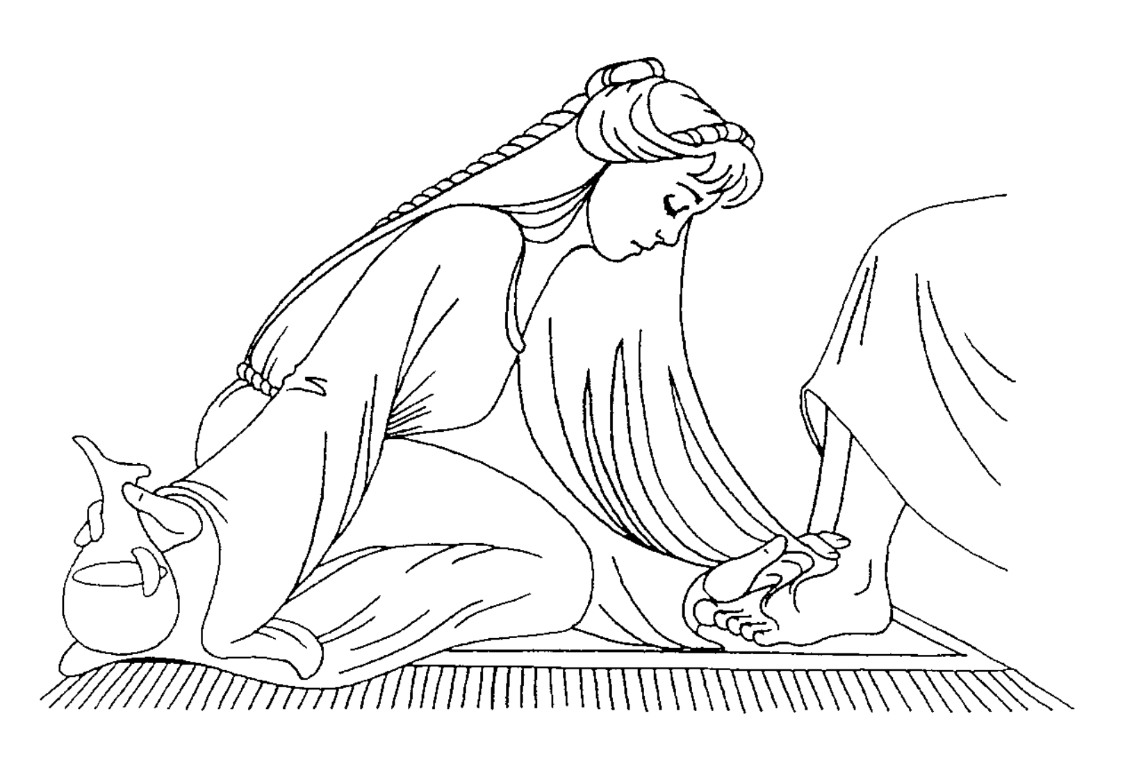
"Anointing Jesus' feet." LUKE 7:36-50