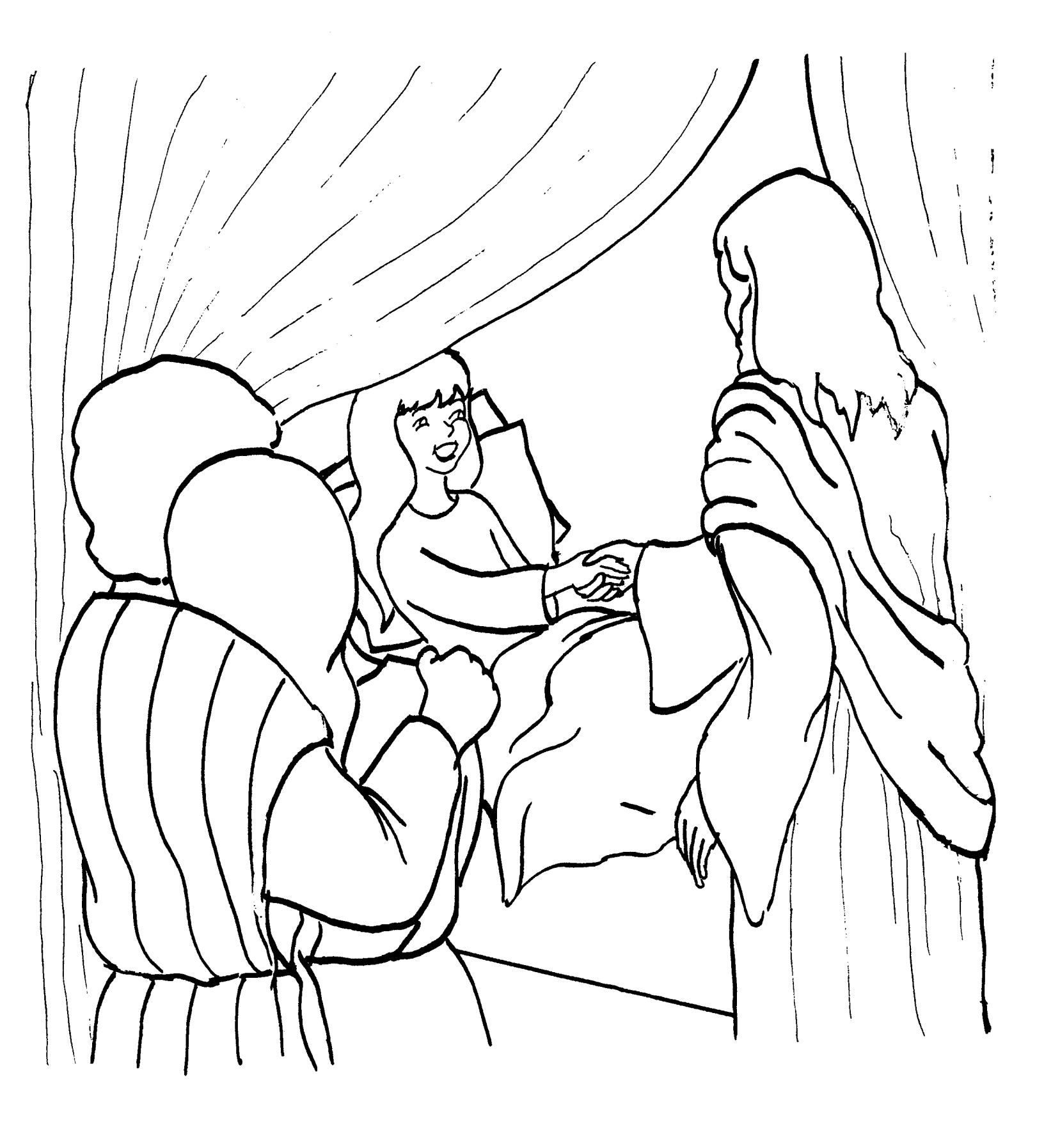
"Jesus raises the daughter of Jairus." Luke 8:40-56