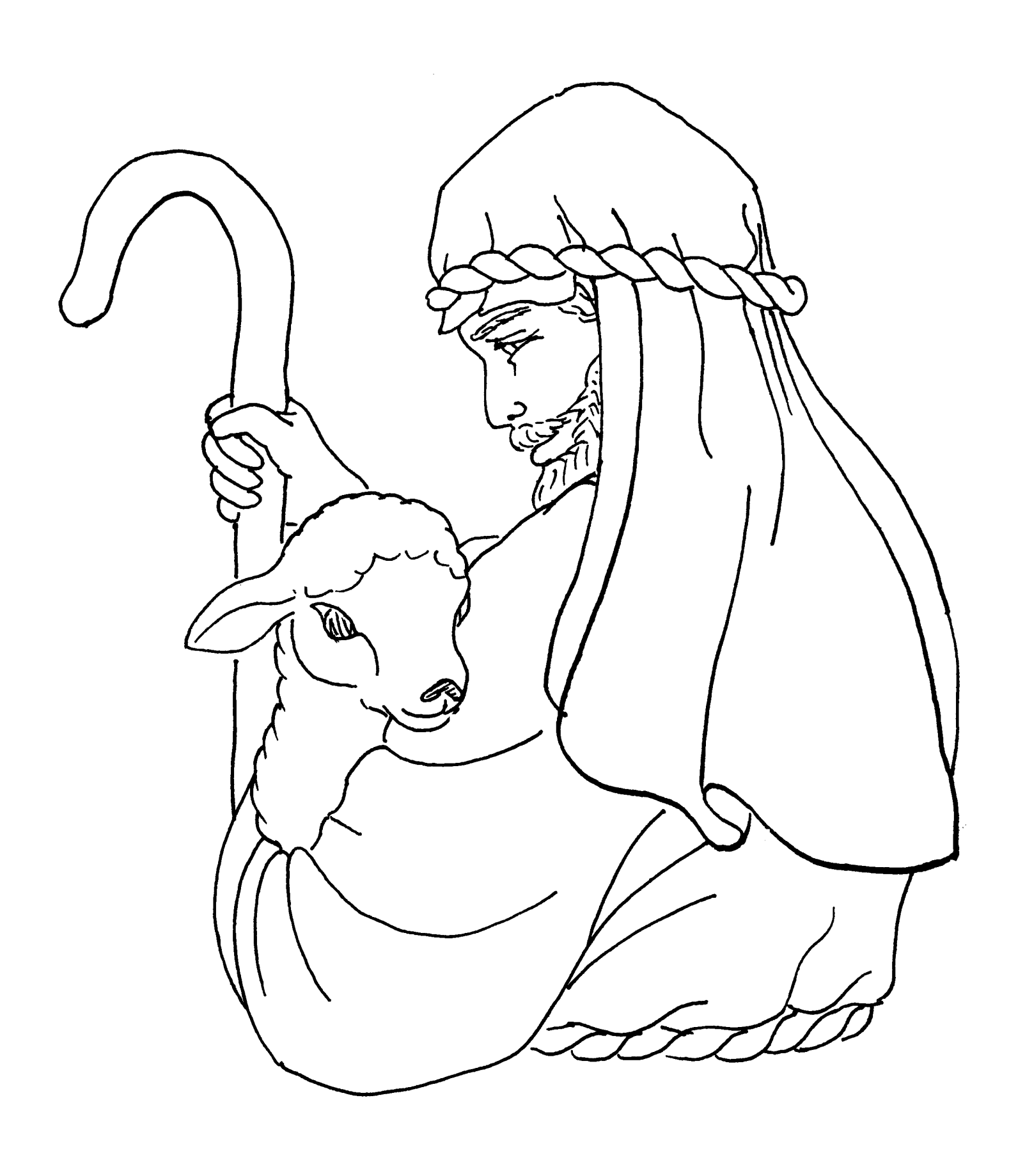
"Jesus said, 'I am the good shepherd. The good shepherd gives His life for the sheep.'" John 10:11