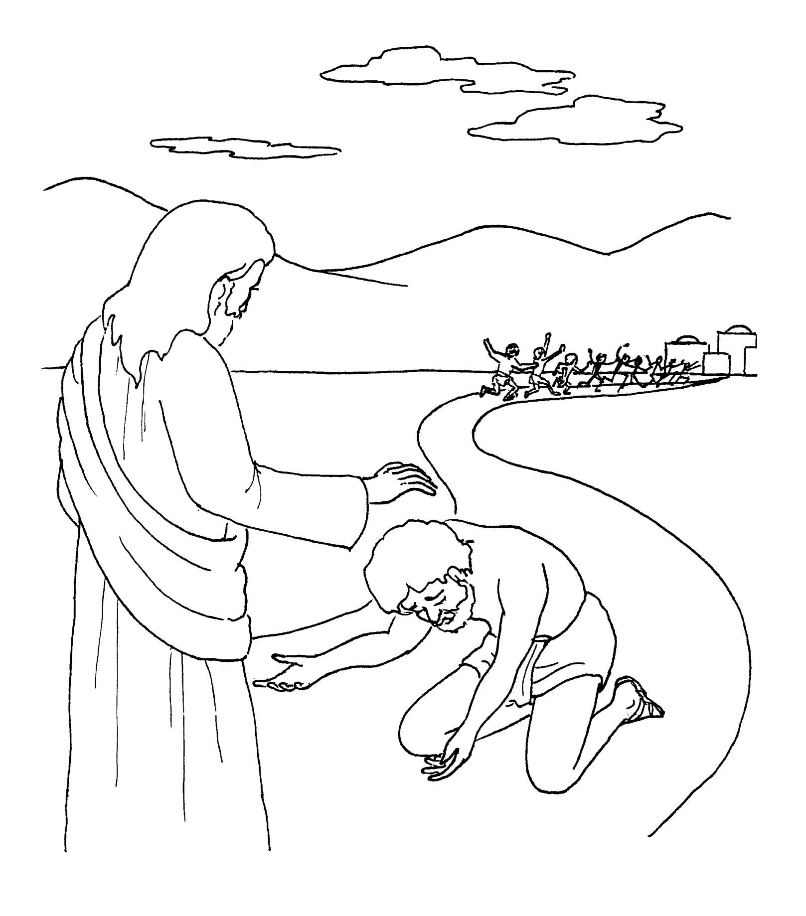
"One of the ten lepers, when he saw that he was healed, returned , and with a loud voice glorified God." Luke 17:15