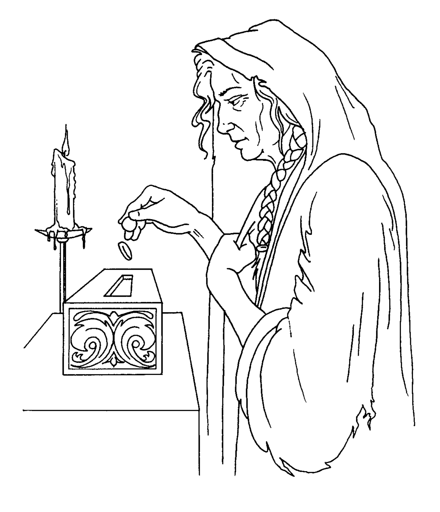
"Jesus said, 'Truly I say to you that this poor widow has put in more than all.' " {\it LUKE~21:1-4}