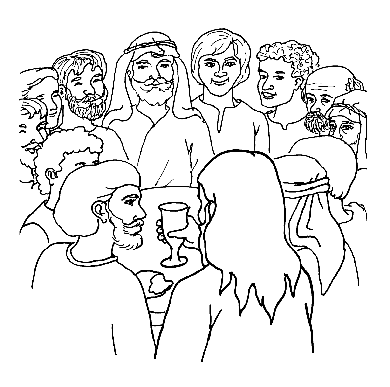
"Jesus presents the new covenant to His disciples at the last supper." Luke\ 22:7-20