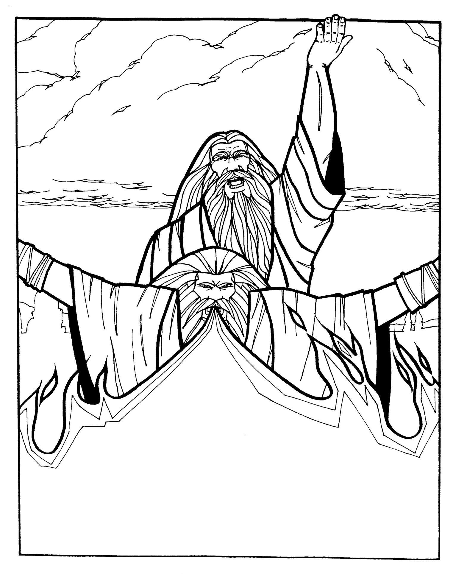
The two witnesses. REVELATION 11:1-14