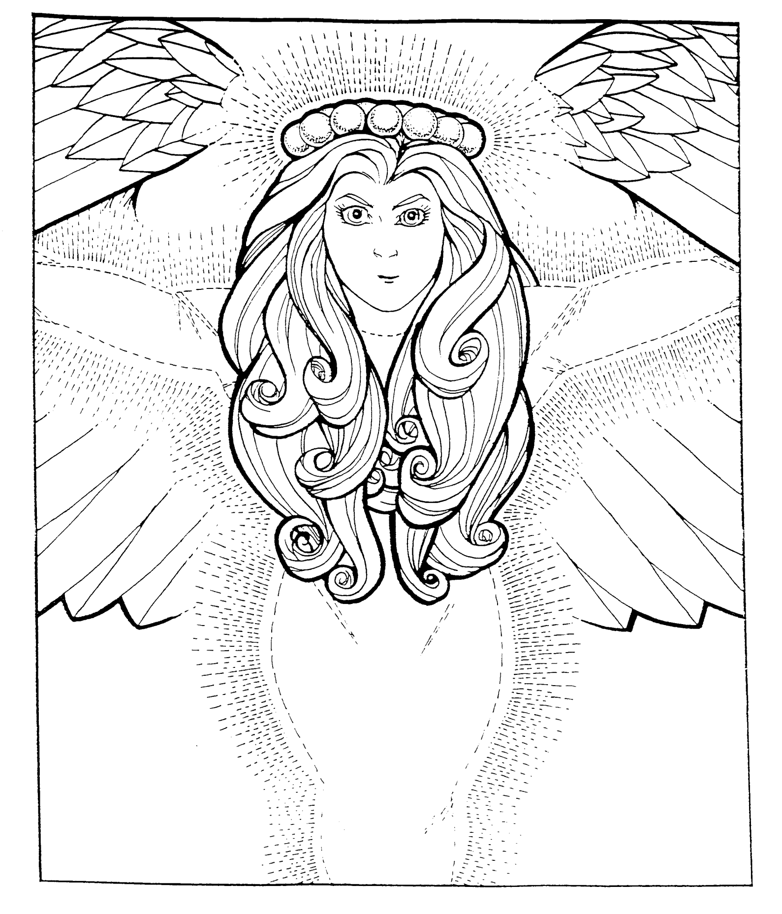
"Now a great sign appeared in heaven: a woman clothed with the sun, with the moon under her feet, and on her head a garland of twelve stars." **REVELATION 12:1**