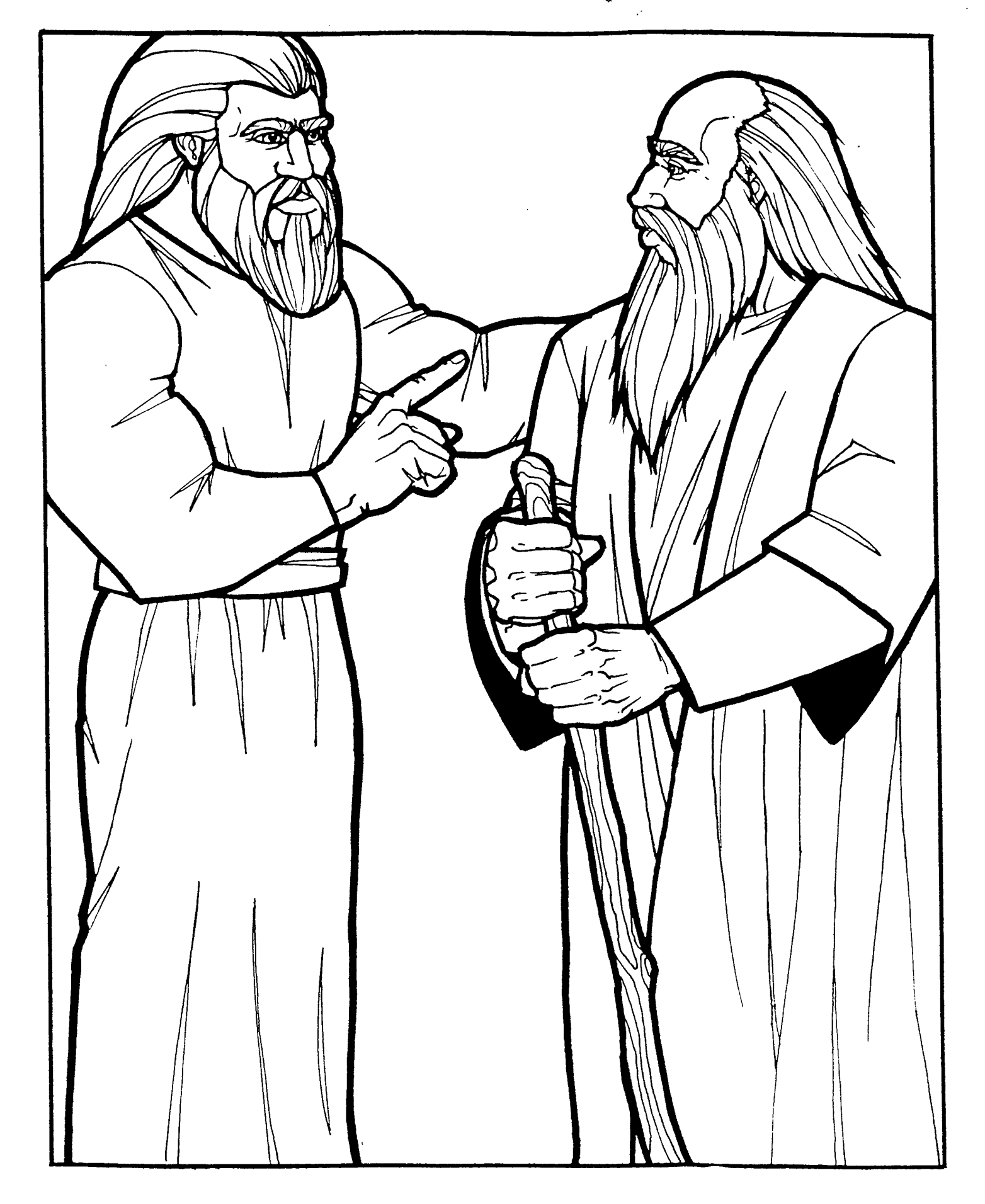
John is told, "These words are faithful and true." REVELATION 22:6